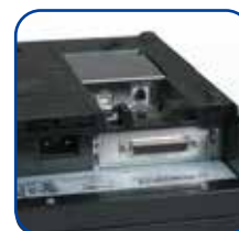
Concealed, Yet Easy to Access Power Supply – Dual Interface Boards Allow a Variety of Configurations