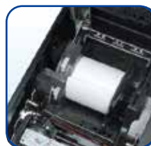
Drop and Print Paper Loading with Built-In Paper Width Selector