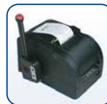
Optional Audio/Visual Print Messenger