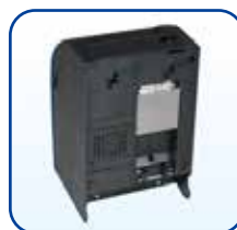
Built-In Wall Mount Capability