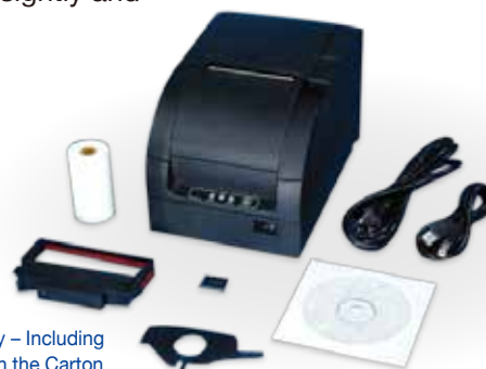
Contains Everything Necessary – Including the Communication Cables – in the Carton