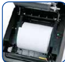
Drop and Print Paper Loading