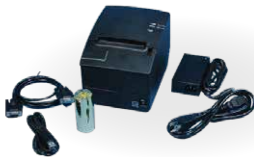
Contains Everything Necessary – Including the Serial and USB Communication Cables – in the Carton