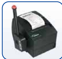
Optional Audio/Visual Print Messenger