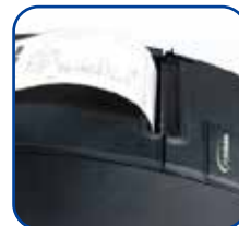
Liquid Guard Built Into the Cabinet Design