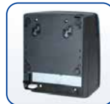
Built-In Wall Mount Capability